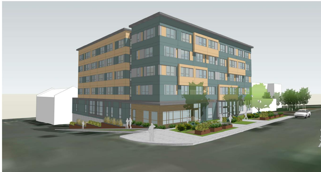
VIEW FROM THE CORNER OF LOMBARD AND 33RD